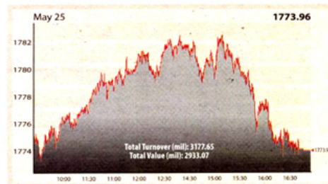
BURSA MALAYSIA DERIVATIVES